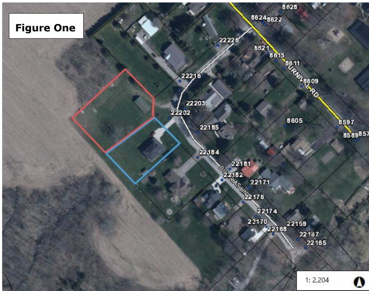
Figure One below, depicts the existing parcel and the proposed lot creation. The red outline is the proposed new lot. The blue outline is the retained and location of the existing dwelling.

The Public Hearing is scheduled for October 26, 2022, at the Elgin County Land Division Committee Meeting.