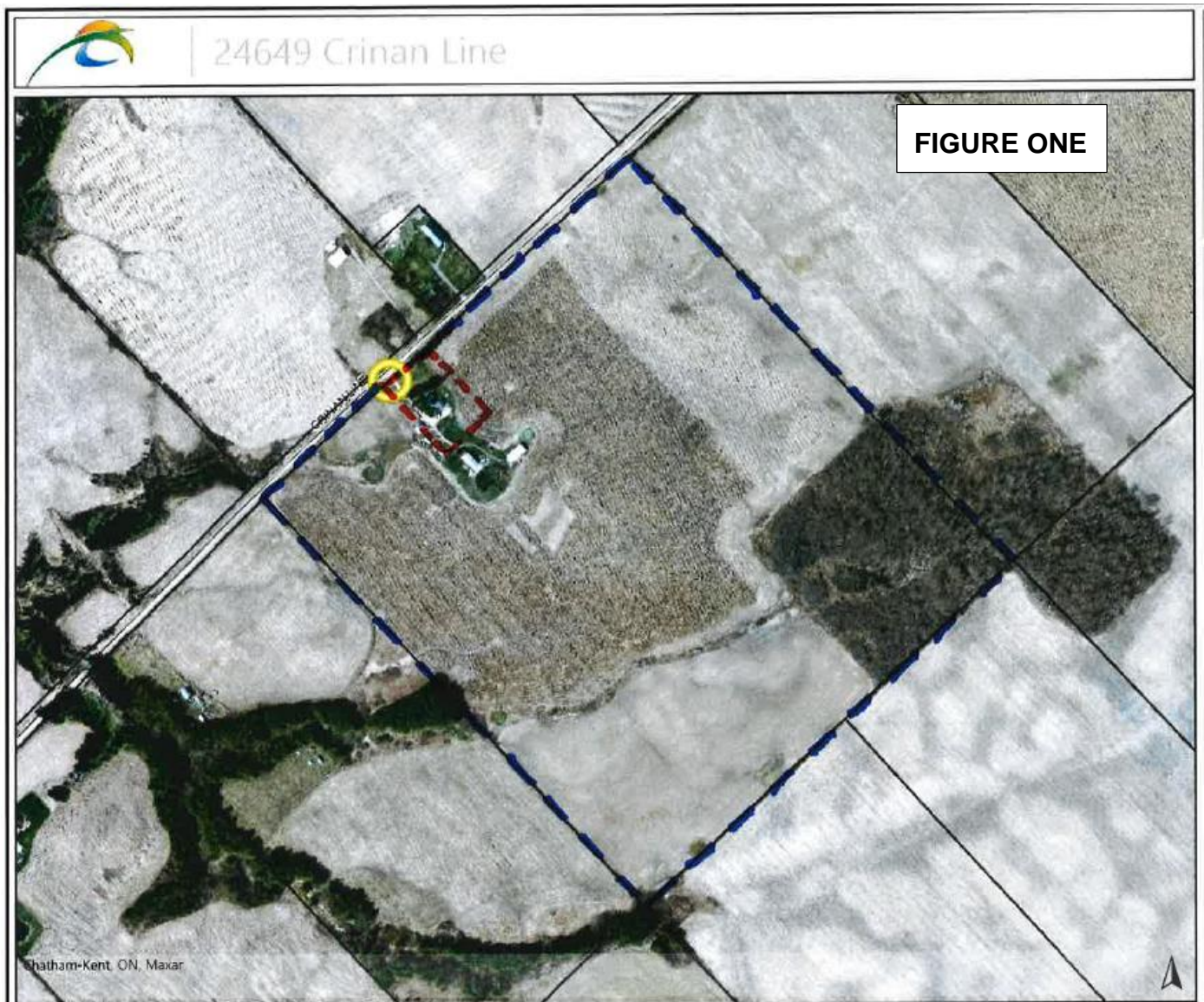
Figure One below, depicts the subject parcel of land.

The Public Hearing is scheduled for August 28, 2024, at the Elgin County Land Division Committee Meeting.