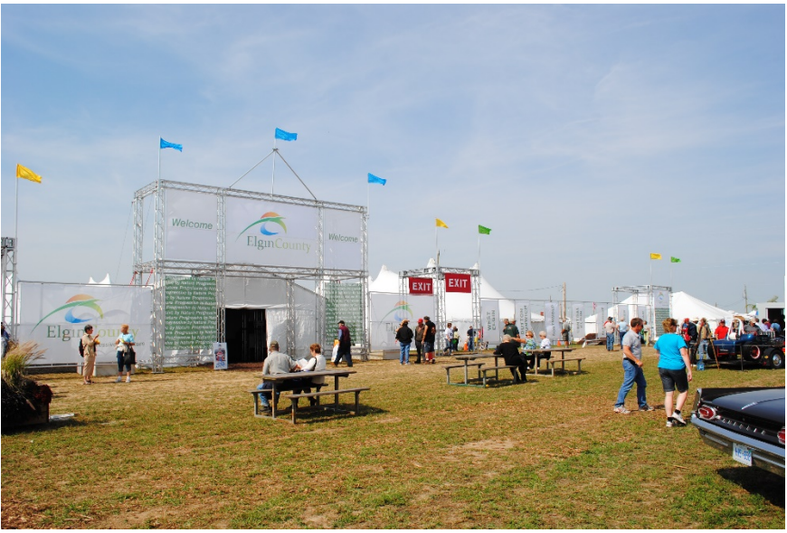
Entrance to the Elgin County Exhibit at the 2010 International Plowing Match