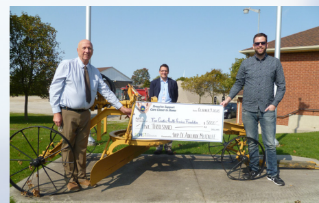
Township of Adelaide Metcalfe - $5,000 towards Ultrasound Campaign