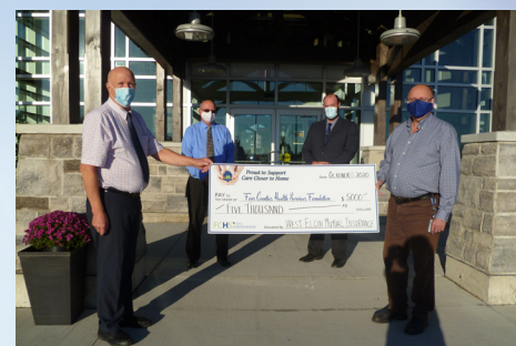
West Elgin Mutual Insurance - $5,000 towards Ultrasound Campaign