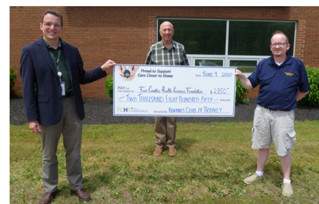
Kiwanis of Rodney – $2,850 Trivia Night Proceeds