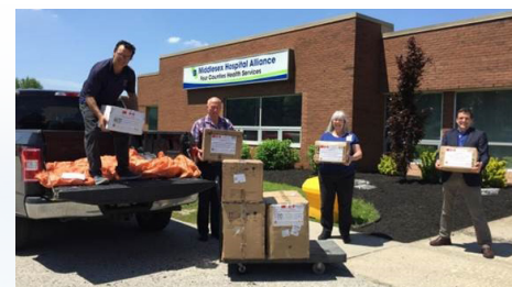
Wardsville Golf Course – PPE donation