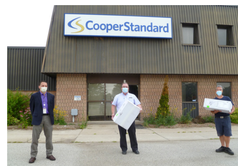
Cooper Standard Glencoe – PPE Face Shields