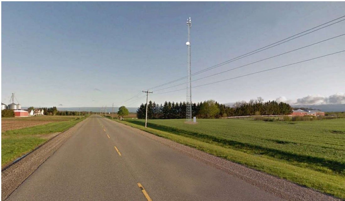
With the proposed Xplornet tower: looking north/northeast from Clachan Road