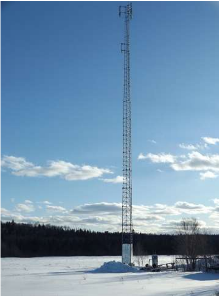
Figure 2 – Example Tower Elevation

The tower height allows the antenna equipment to propagate wireless signals over top of obstacles (trees, buildings, varying topography) and maintain line of sight connections to other Xplornet facilities in the network. The proposed installation design provides an opportunity to accommodate future technologies as well as potential co-location with other licensed carriers, thus limiting the number of new tower structures required in the area.