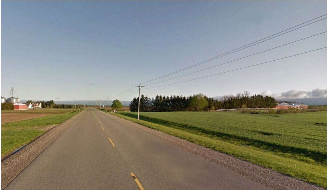
Existing property: looking north/northeast from Clachan Road

The figures below show the property from Clachan Road before the tower and with the proposed Xplornet tower.