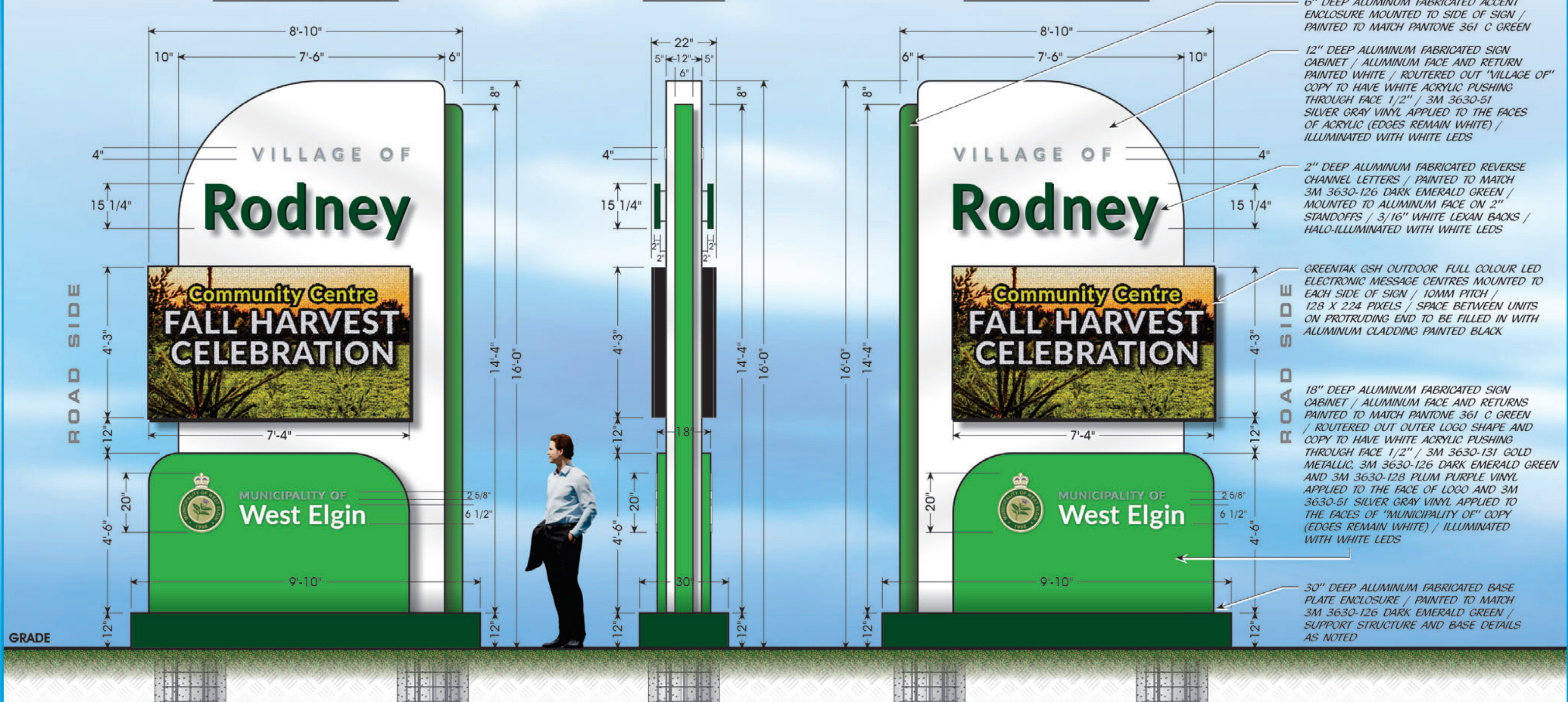
FRONT VIEW (SIDE TWO)

SIGN TYPE: D/S ILLUMINATED GATEWAY MONUMENT SIGNS - PROPOSAL "A"