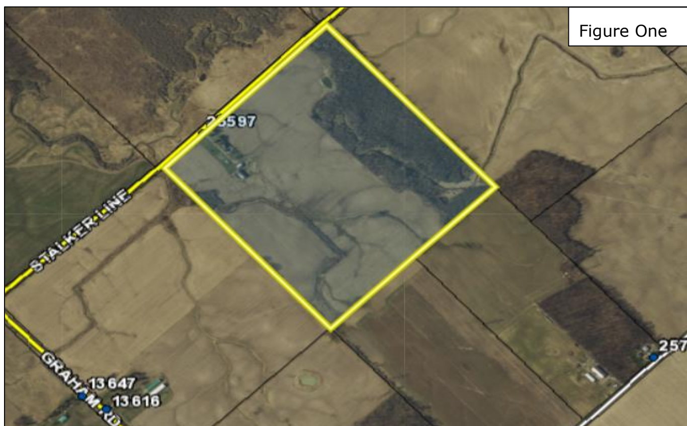
Figure One below, depicts the subject lands:

The surrounding land uses are as follows: