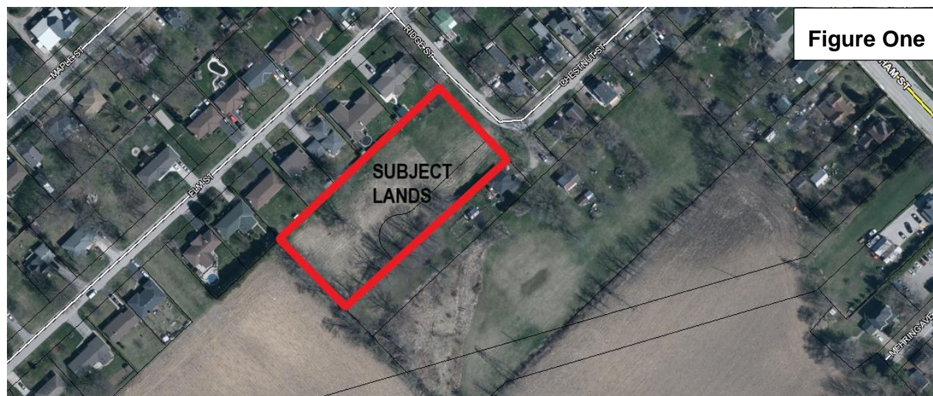
Figure One below, depicts the subject lands:

The surrounding land uses are as follows: