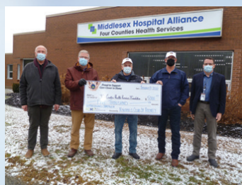
Kiwanis Club of Rodney - $5,000