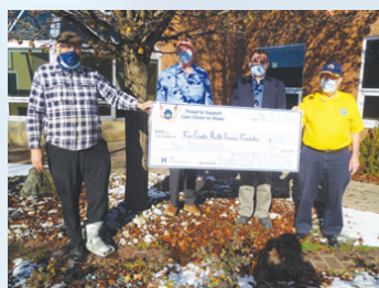
Kiwanis Club of West Lorne - $2,000