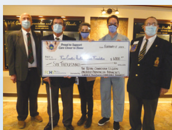
RCL Ontario Provincial Command Branches & Ladies Auxiliary Charitable Foundation - $6,000