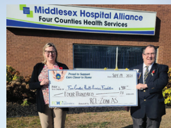
RCL Zone A - $400